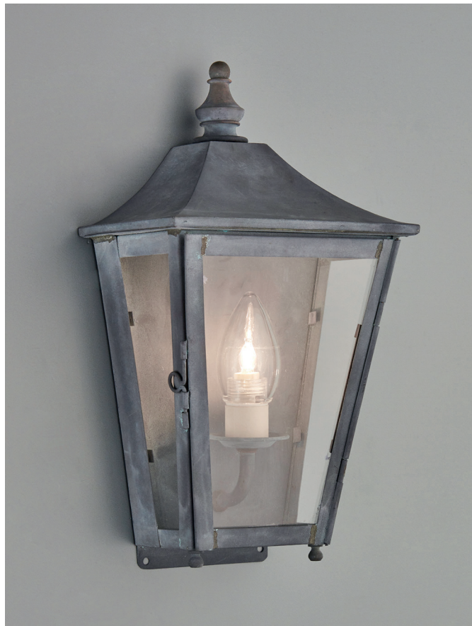
ATHENA WALL LANTERN IN ZINC WL334S