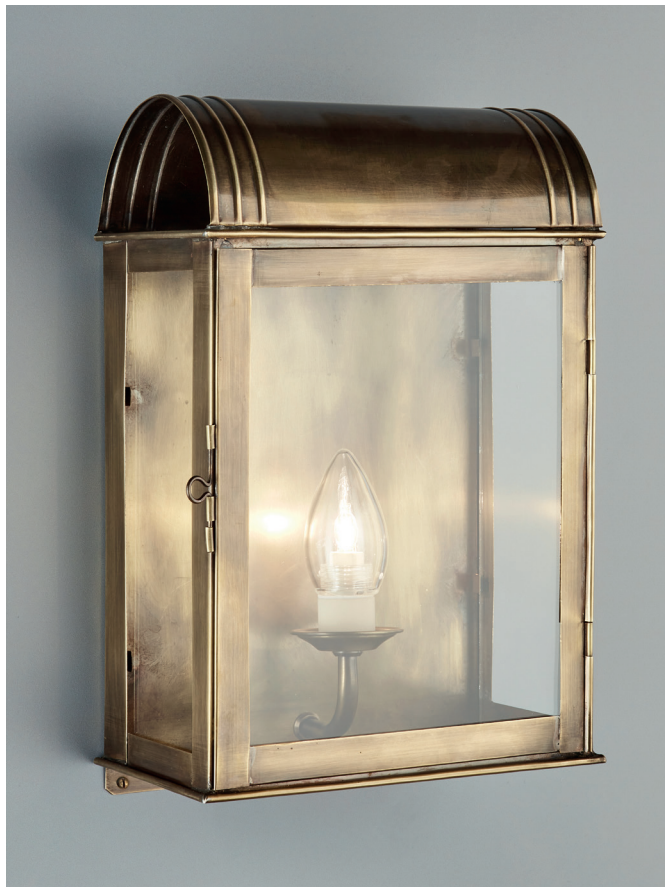
CLIO LANTERN, LARGE IN ANTIQUE BRASS WL334L