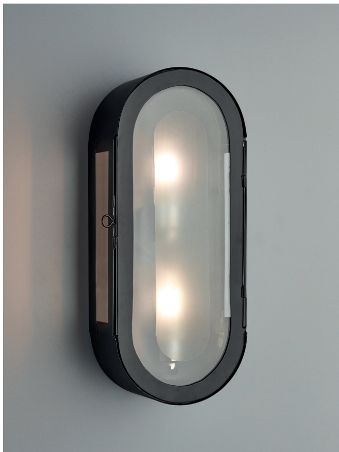
HERMES WALL LANTERN IN BRONZE WL333