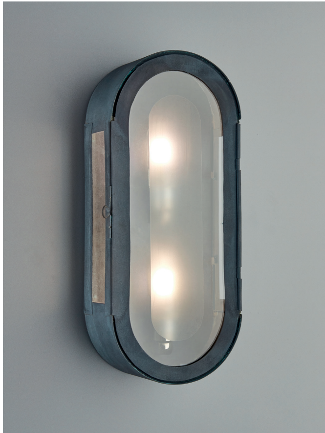
HERMES WALL LANTERN IN ZINC WL333