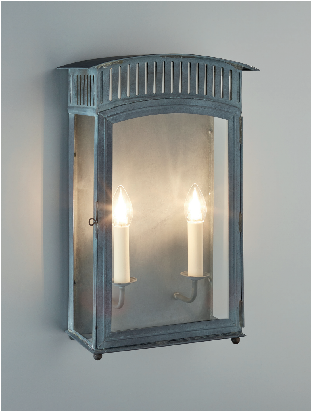
ETNA LANTERN, LARGE IN ZINC WL459