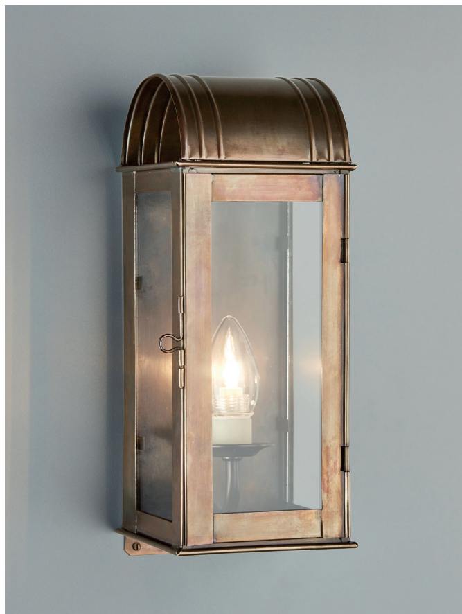
CLIO LANTERN, SMALL IN ANTIQUE BRASS WL334S