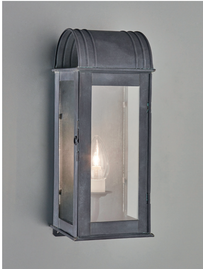
CLIO LANTERN, SMALL IN ZINC WL334S