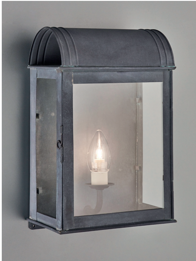
CLIO LANTERN, LARGE IN ZINC WL334L