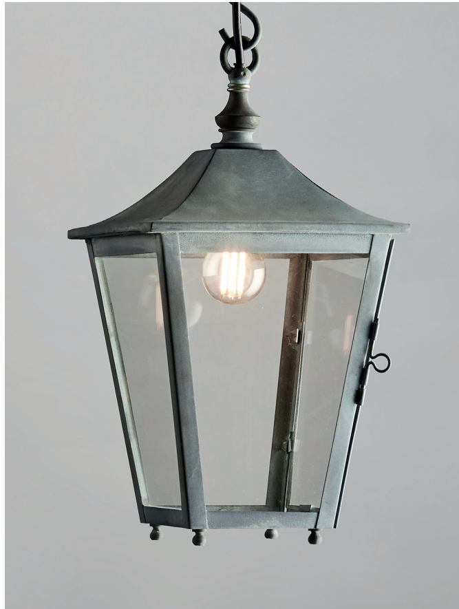
ATHENA HANGING LANTERN IN ZINC WL412