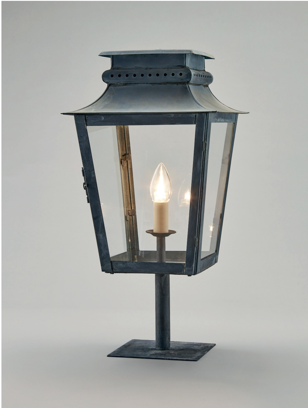
ZEUS LANTERN ON POST MOUNT WL308