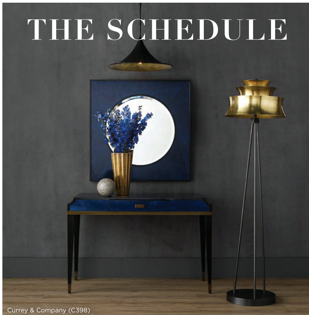
Currey & Company (C398)